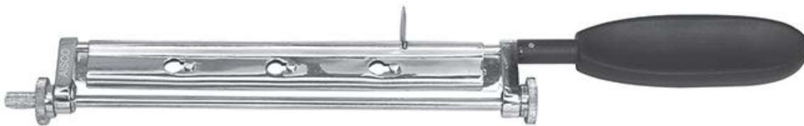
SKIN GRAFTING HANDLE, HUMBYS 10.400