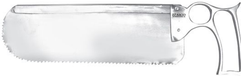
AMPUTATION SAW STANDARD 10.321