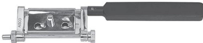
SKIN GRAFTING HANDLE SILVERS (RAZOR BLADE FITTING) WITH GRAFT THICKNESS ADJUSTMENT 10.425