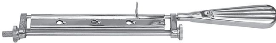
SKIN GRAFTING HANDLE, HUMBYS 10.405